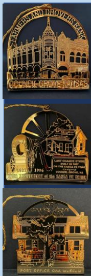
Three Metal Ornaments- Ornaments depicting the Post Oak, Drovers Bank, and Last Chance Store in Council Oak supporting the State Regent’s Project.