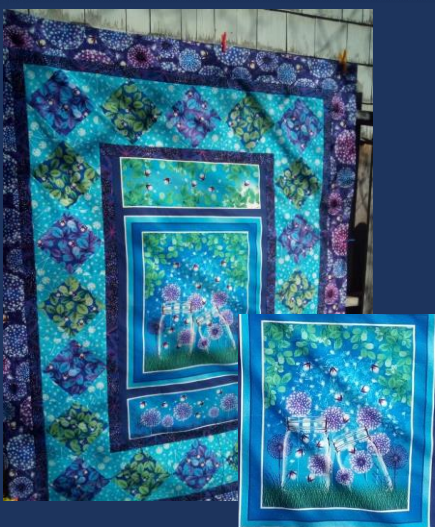
Firefly Quilt- Anonymous Donor Supports KSDAR Junior Membership Fund.