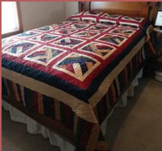
Kansas Tornado Quilt – Won by Retha Blecha

Though we won't be meeting again until the State September Meeting, you still have the opportunity to buy voices for some great items while supporting KSDAR. Voices are chances to win an item. Two items were drawn at the State Conference, but the rest will be drawn at the State September Meeting. Voices are $5 for one or $10 for three. You can buy voices online at: https://ksdar-voices.square.site/