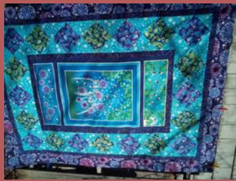
Firefly Quilt- Anonymous Donor Supports KSDAR Junior Membership Fund.