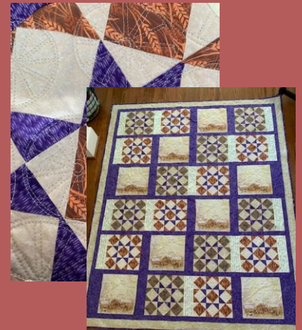
Santa Fe Trail Commemorative Quilt – Supporting State Regent's Project. Includes locations of DAR markers complimented by wheat and buffalo fabric.