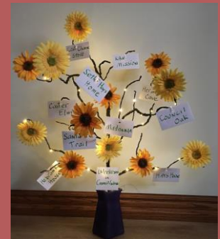
Council Grove Get-Away – Sponsored by the Council Oak Chapter. Supports the Historical Markers and Archives Fund.