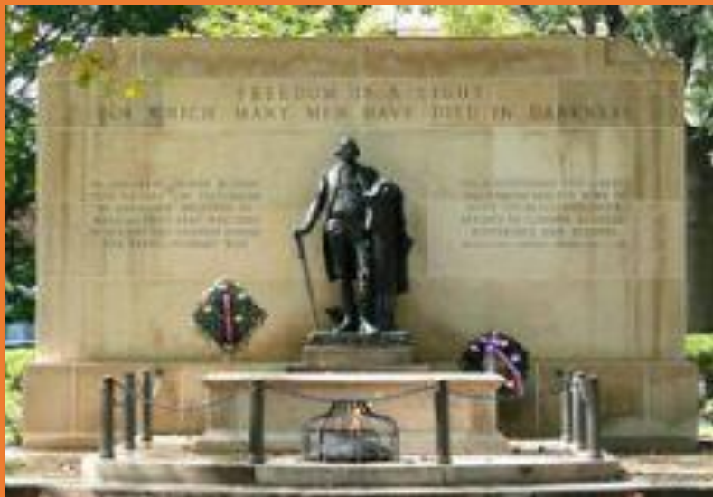
Tomb of The Unknown Soldier Revolutionary War Washington Square Philadelphia, Pennsylvania

We all know and honor the Tomb of the Unknown Soldier located at Arlington National Cemetery overlooking Washington, D.C. This national monument was built to honor all the service men and women lost during war. During April 2021, this monument will be celebrating a 100-year anniversary.