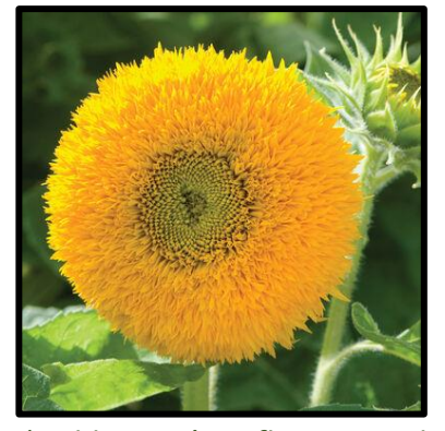
'Teddy Bear' sunflower. Seeds available at Johnny's Seeds.

To plant sunflowers, sow seeds directly into the soil after the last frost. Some sunflowers can be planted a bit before the frost, I recommend waiting till the soil starts to warm. There are many benefits to planting sunflowers including providing food to pollinators, food for birds or humans depending on the variety, and of course, decoration for the garden and home. I look forward to seeing all your sunflowers this year!