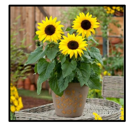
Patio sunflower 'SunBuzz'. Seeds available at Garden Trends. Garden centers may have these if you want to buy a full plant later.