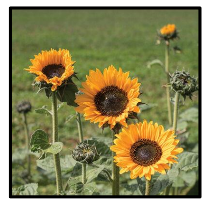
'Soraya' sunflower. Seeds available at Johnny's Seeds.