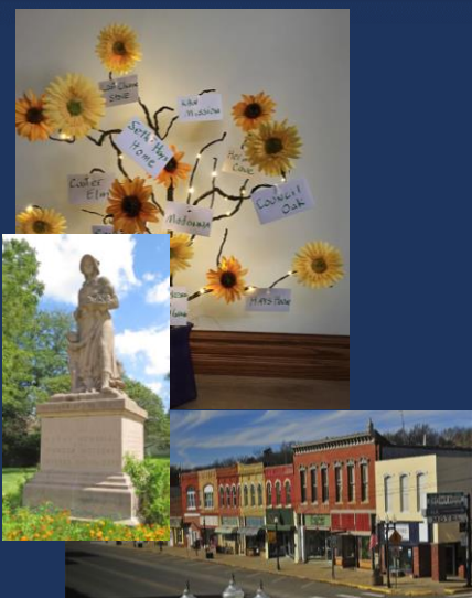
Council Grove Get-Away – Sponsored by the Council Oak Chapter. Supports the Historical Markers and Archives Fund.