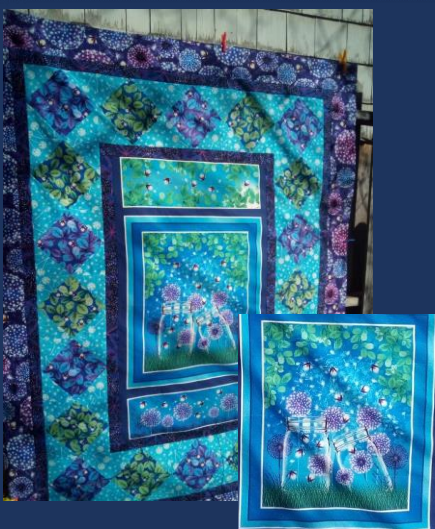
Firefly Quilt- Anonymous Donor Supports KSDAR Junior Membership Fund.