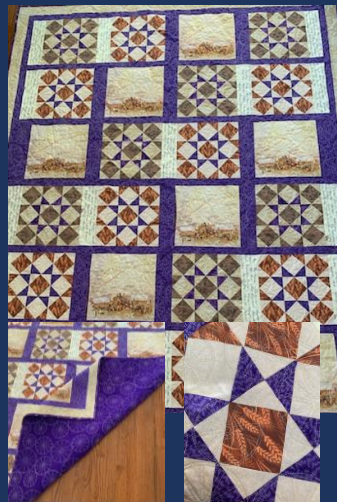
Santa Fe Trail Commemorative Quilt – Supporting State Regent’s Project. Includes locations of DAR markers complimented by wheat and buffalo fabric.

Purchase your Voices for an opportunity to win one of the great items that will be offered at the State September Meeting. Voices can be purchased in person at the State September Meeting, on your registration form or in advance at: https://ksdar-voices.square.site Voices are $5 each or three for $10!