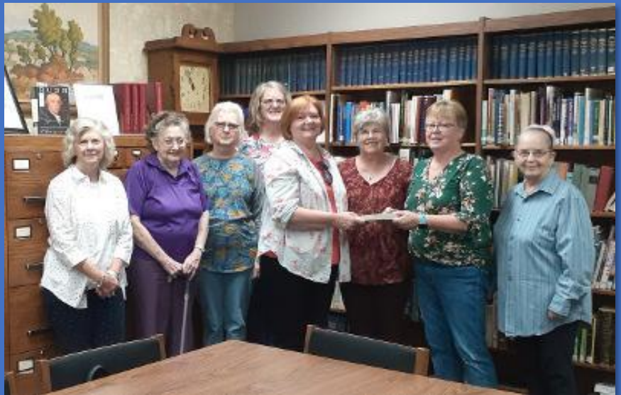
Members of the Good Land Chapter presenting books to the Goodland Public Library.

Recently, the chapter presented two books to the Library for the special section. The two selections chosen by the DAR Library for this year have been so popular that the Good Land Chapter is expanding the project to two more libraries in the area. The chapter sees this as an excellent way to familiarize more people with the DAR and to promote membership opportunities.