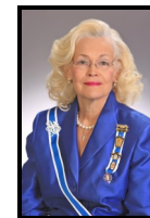
State Regent of Massachusetts