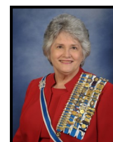
State Regent of Texas