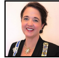
State Regent of Florida