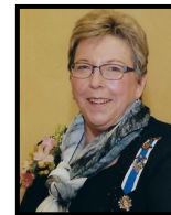
State Regent of Ohio