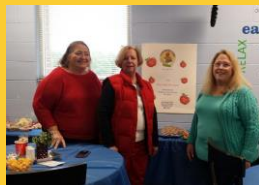
Three Trails West provided teachers with treats.