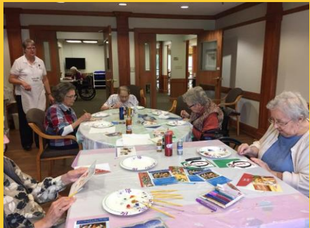
Arthur Barrett Chapter worked with nursing home residents to make cards for veterans.