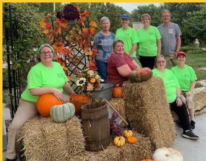
The Olathe Chapter cleaned veteran graves and decorated for Fall at the Olathe Cemetery.