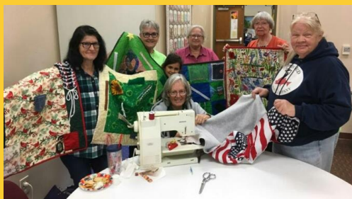
Flores del Sol members made lap blankets.

This year's day of service had chapters across the state engaging in meaningful service activities that benefitted our communities. Many chapters worked together on projects while others worked as a chapter to make a difference in others' lives. Below are just a few of the activities in which Kansas Daughters participated.