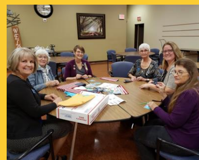
Topeka Chapter folded pocket flags.