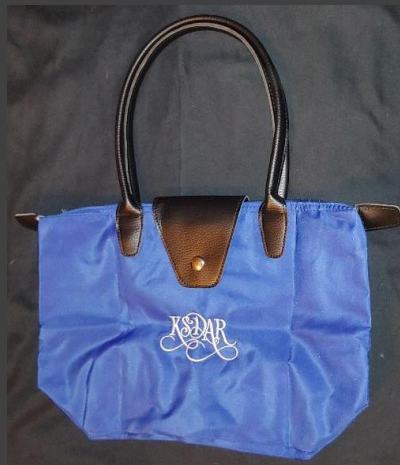
Folding Bag $35 plus tax