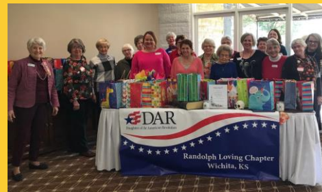
The Randolph Loving Chapter created "Birthday in a Bag" that included cake mix, frosting, etc. so poor families can give their children birthday parties.