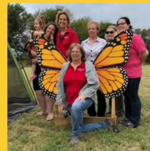
Uvedale members caught Monarch butterflies, tagged them and then released them.