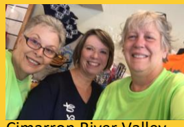
Cimarron River Valley performed Spring Cleaning at the Pancake Day Hall of Fame.