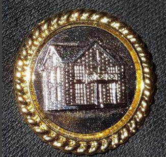
State Regent's Pin $50 plus tax