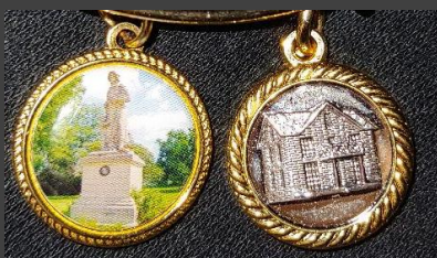
Charms $15 plus tax