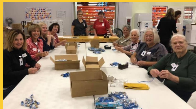
Mission Hills chapter volunteered at Heart to Heart performing a wide range of projects for the organization.