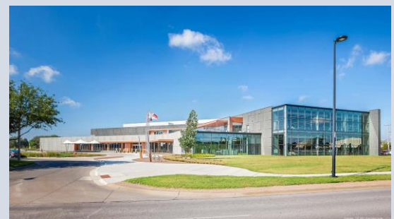
Wichita Advanced Learning Library